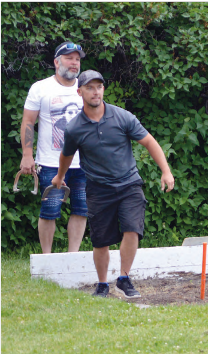
Horseshoe action is set to begin Saturday at 9 a.m. File photo