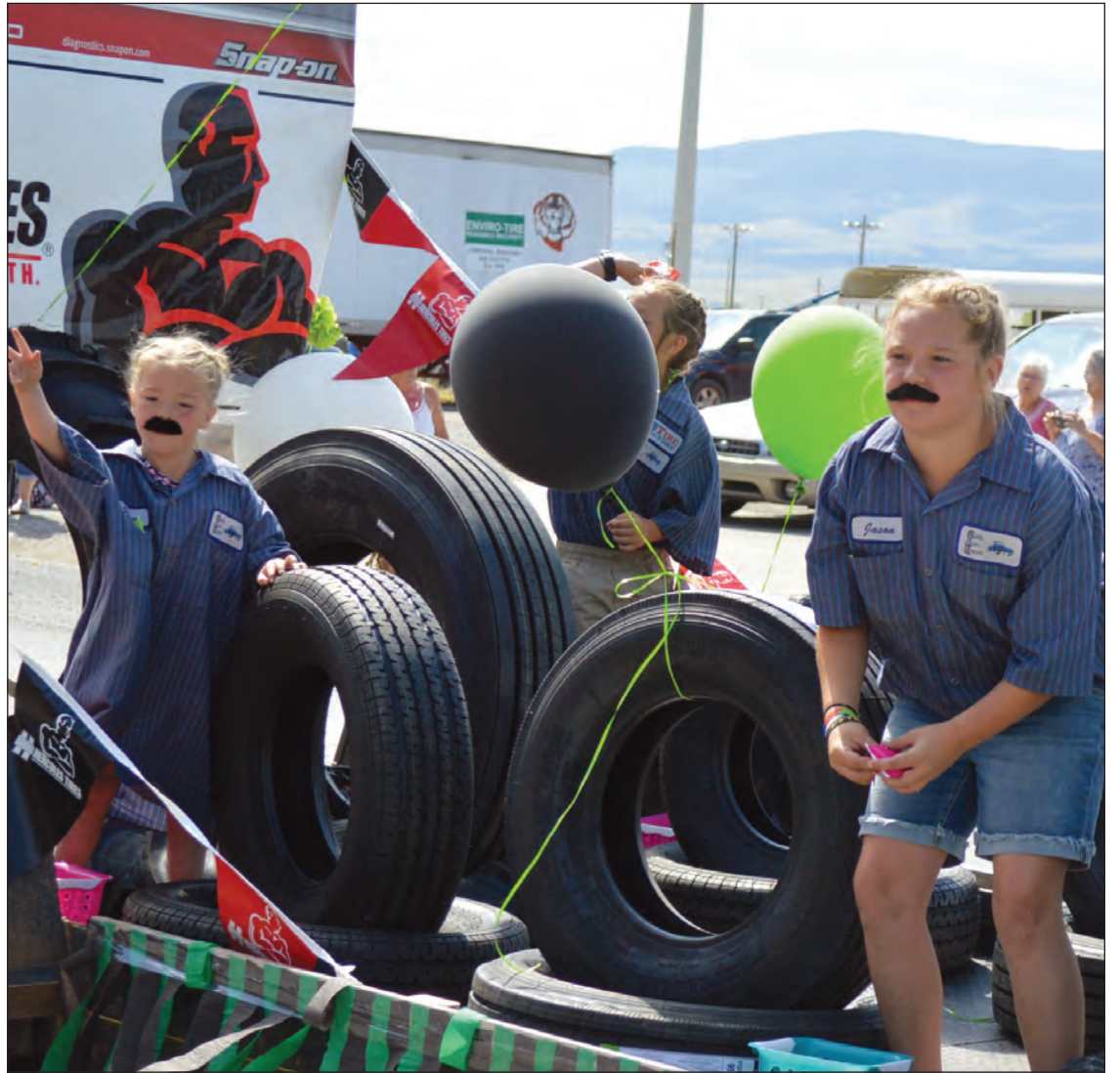
The parade is always a hit at Frontier Days. File photo