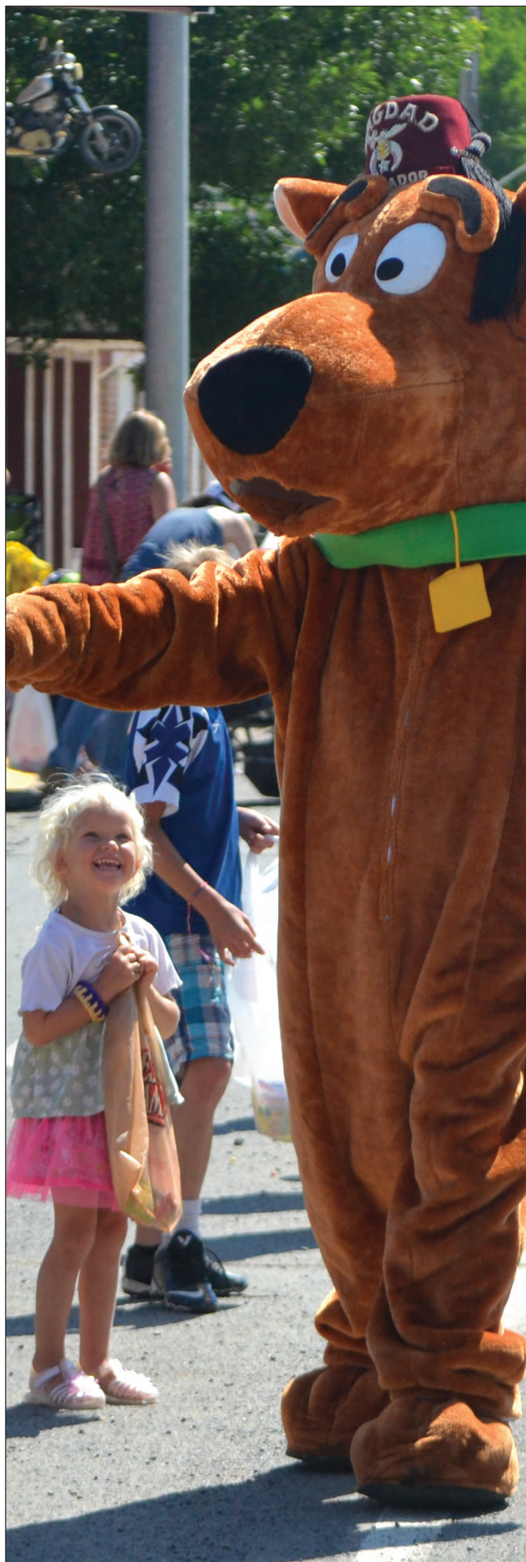
The Whitehall Frontier Days parade is fun for all ages.