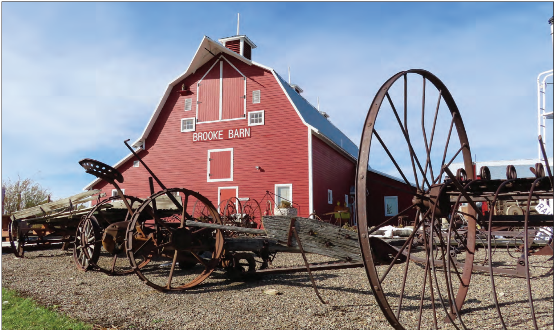
The Jefferson Valley Museum is hosting the annual “Gab Fest” and Historical Tours During Frontier Days