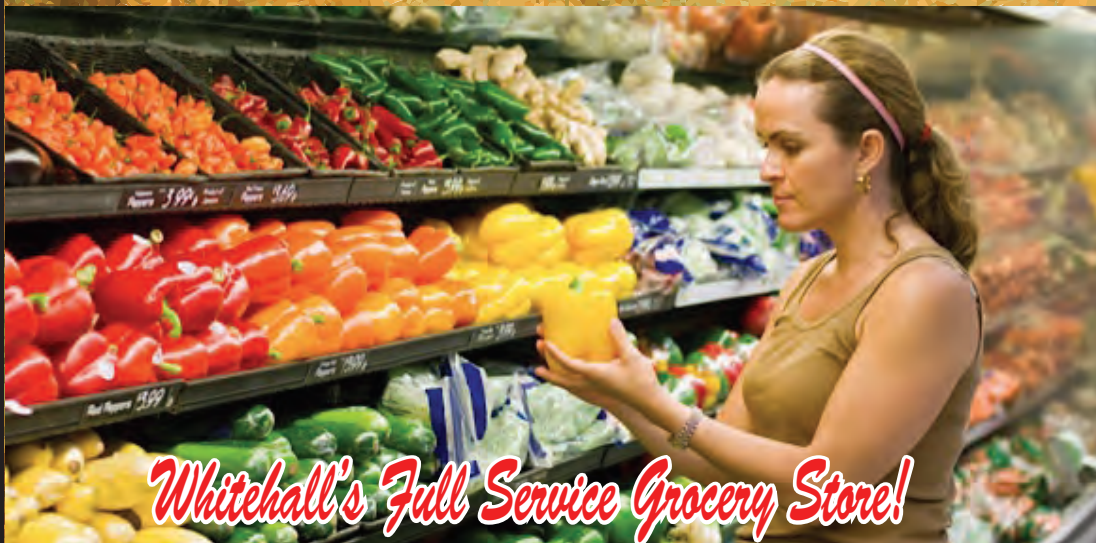
Whitehall's Full Service Grocery Store!

DELI • BAKERY • PRODUCE • MEATS • FINE WINES • MONTANA BEERS • GLUTEN-FREE, ORGANICS & NATURAL FOODS • FRESH-MADE DELI SANDWICHES & HOT CASE FOODS • FRESH DONUTS • TAKE -N- BAKE PIZZA • MONTANA MADE WILCOXSON'S ICE CREAM • COFFEE & CAPPUCINO